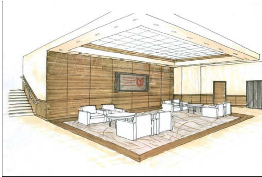
1st floor: soft seating by elevator.