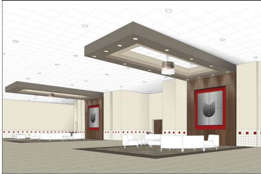
New front entrance to the High School