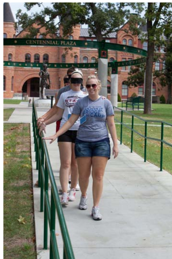
Rookie Bridge Camp participants being guided around campus during the Trust Walk.