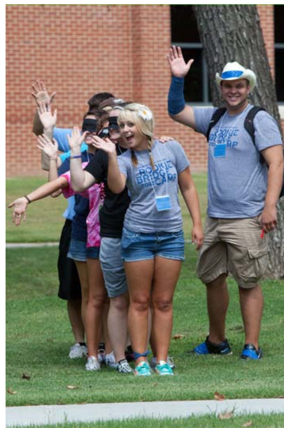
Rookie Bridge Camp participants lining up for the Trust Walk.