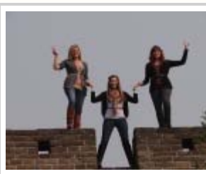
On top o'the #great Wall! #peacesigns