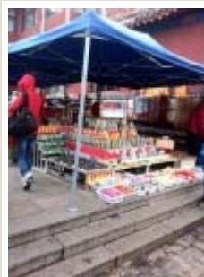
Top o'the mountain. Lots of goods for sale #noisy

halfway. At this point I was just randomly taking pictures in hopes of getting a shot.