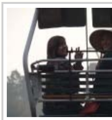
Ski lift to the top #hat