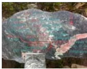
map o'the mountain