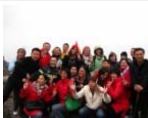
Into this #peacesignfrenzy