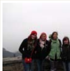
Epitome of China: The five of us taking a picture turned from this...