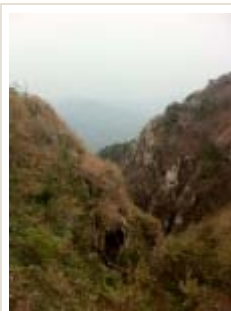
View from about