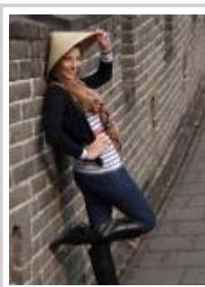
hanging out on the GW, NBD #hat.