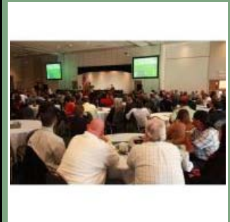
Participants gather from seven counties