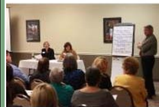
Classroom--Marketing Our Region