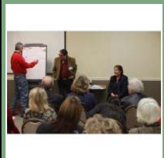
Wilma Mankiller facilitates Asset Mapping